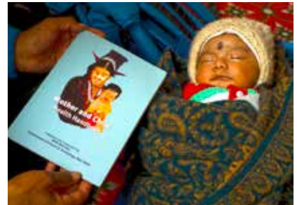
AFH assists in maternal healthcare in remote villages