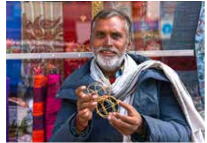
Leh street market

Built on a green hillside surrounded by spectacular mountains, Hemis is the biggest and the most important monastery in Ladakh. It was built in the 17th century by Chapgon Gyalshas and ever since has enjoyed the patronage of the royal family. Hemis is the headquarters of the Drukpa order and all the monasteries throughout Ladakh are administered by it. This wealthiest monastery contains gold statues and stupas decorated with precious stones and many priceless old Thankas. .