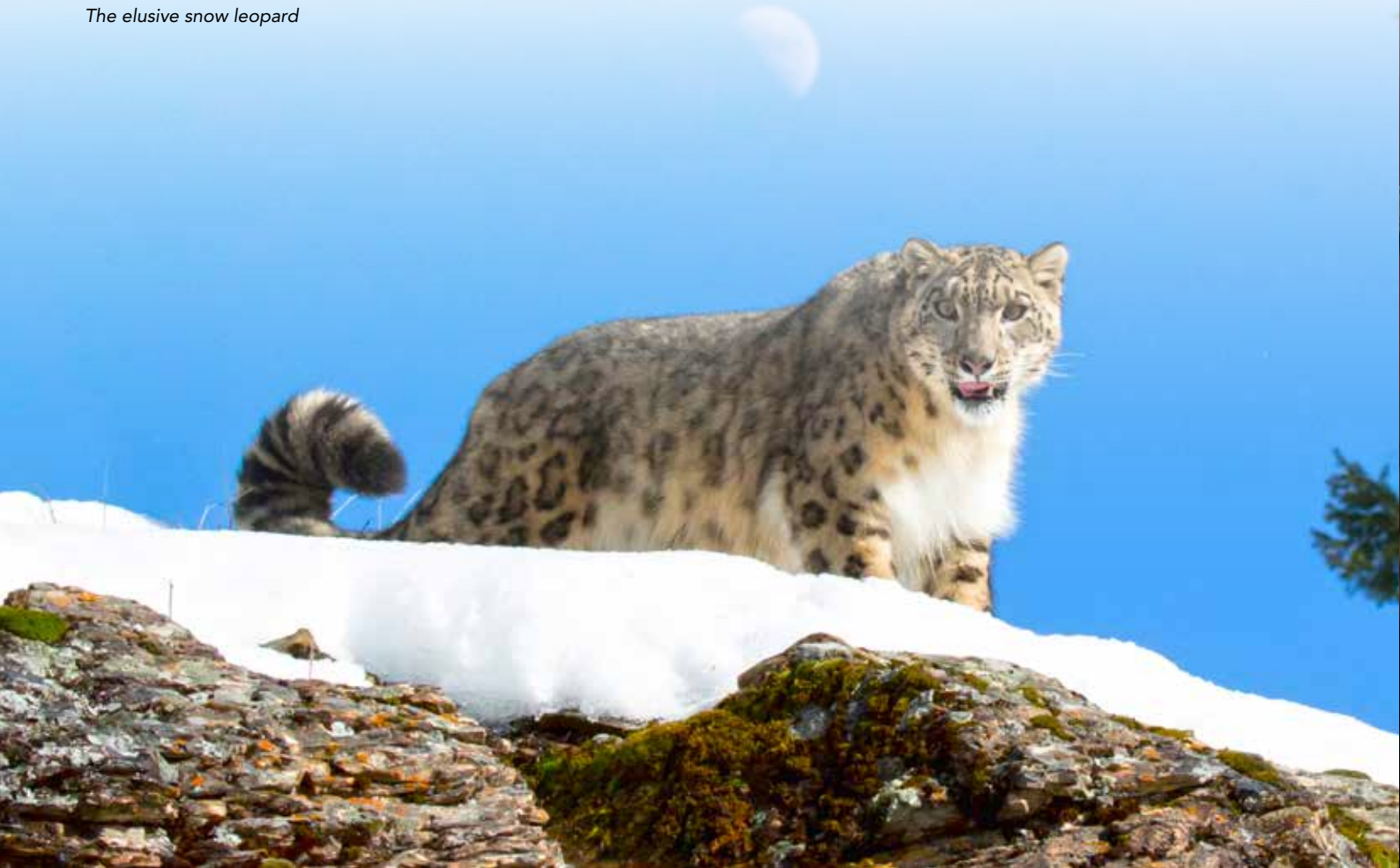
The elusive snow leopard

The SLC supports community-based protection