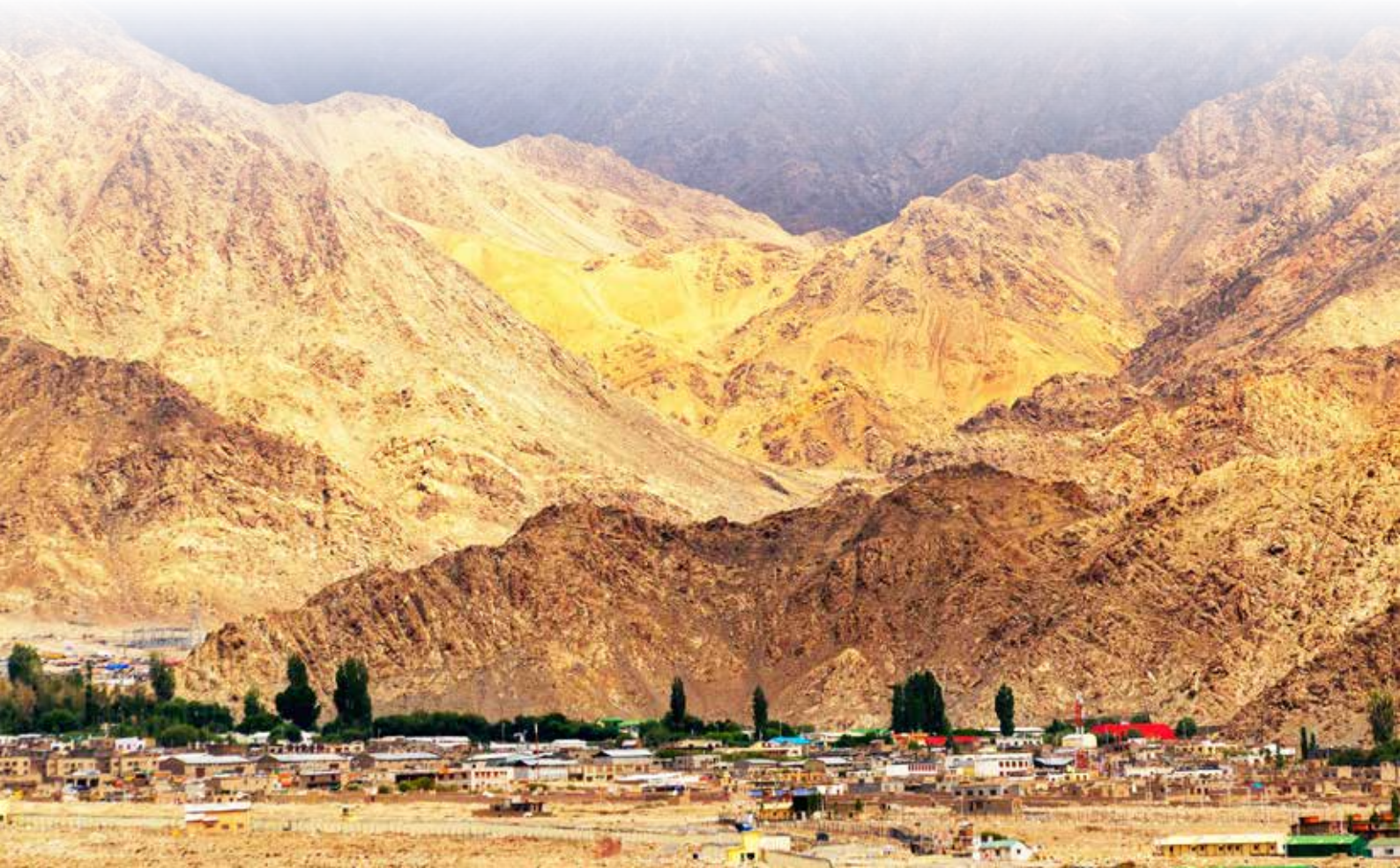
Rocky landscape of Leh City