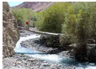
Near the Markha Valley