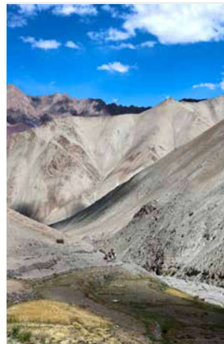
Typical trekking landscape in Ladakh