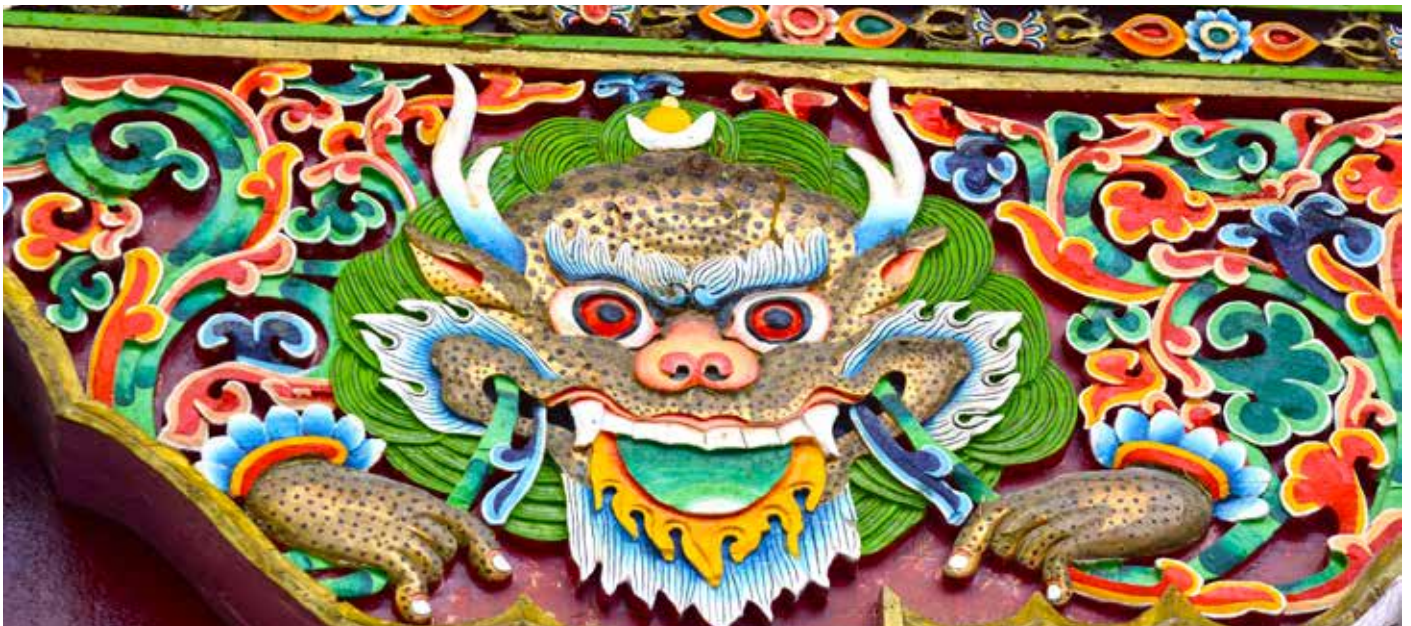
Traditional Tibetan art