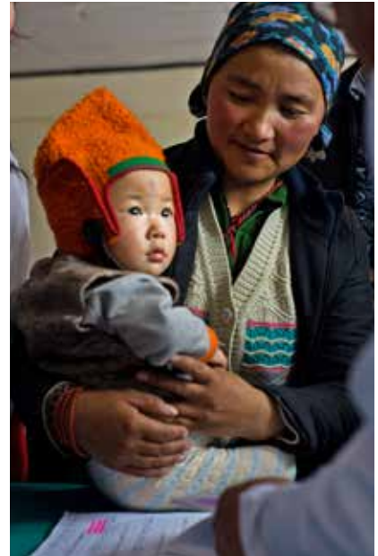
Amchi healers workshop