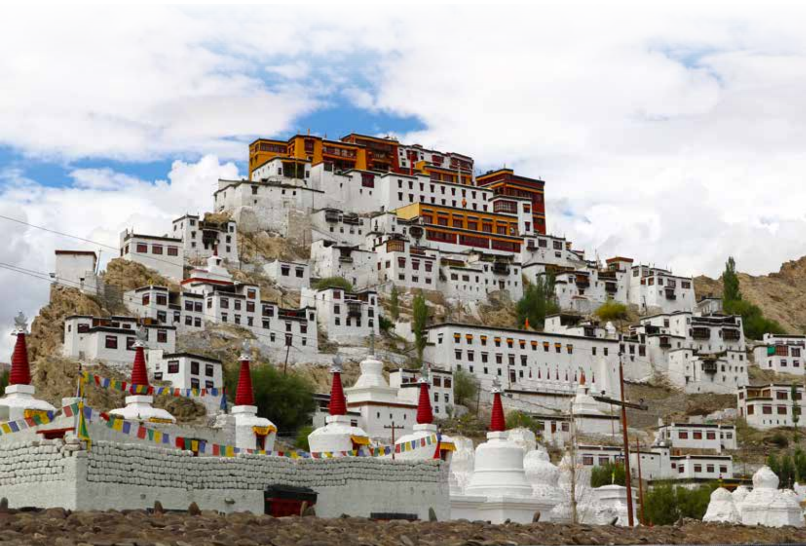
Thiksey Monastery, Leh