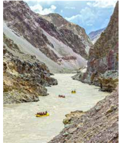
Rafting on the Zaskar

After breakfast transfer to the airport for onward arrangements. (B)