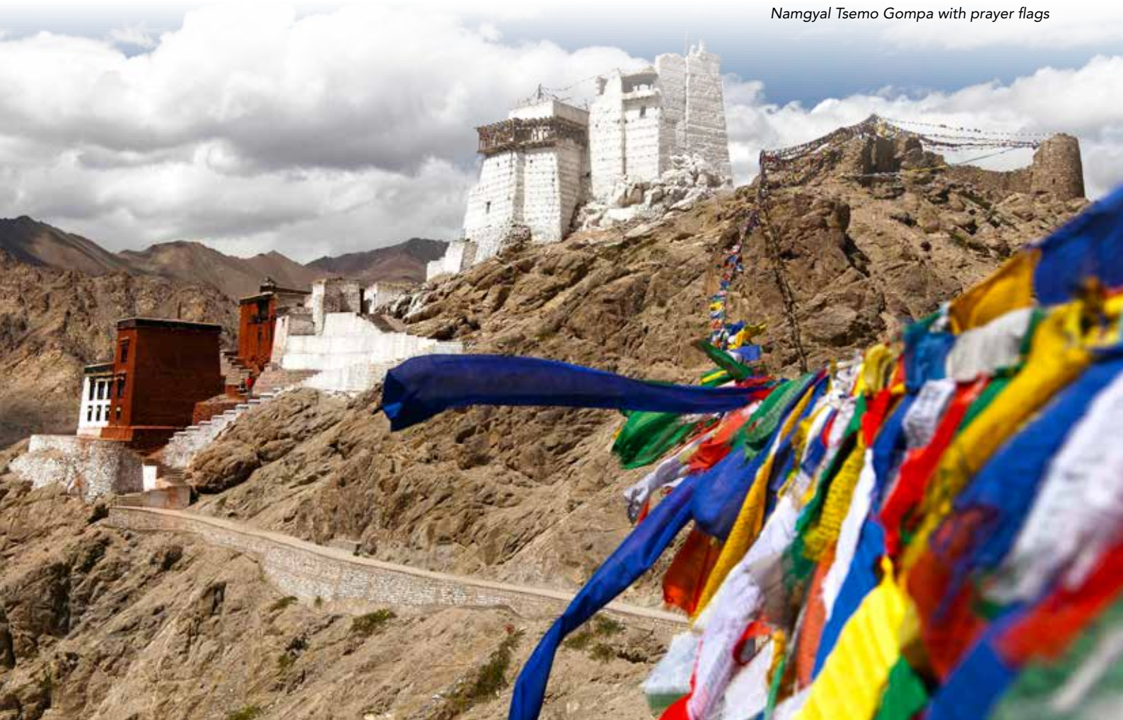
Namgyal Tsemo Gompa with prayer flags