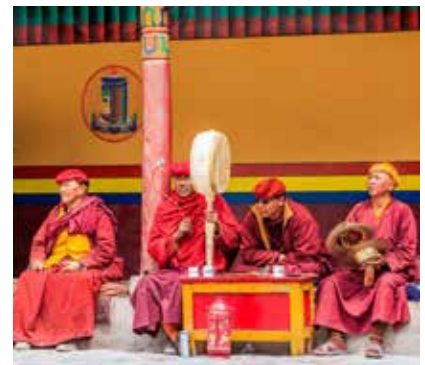
Buddhist monks at an opening ceremony of the Hemis Festival